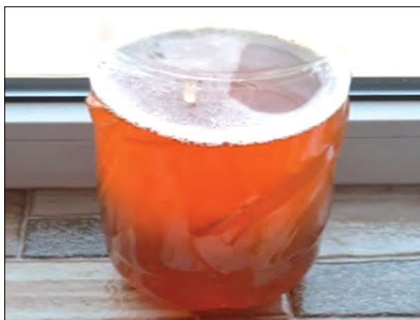
FIGURE 1. Collected urine with hematuric aspect

pressive tumor that might have led to these stenotic changes.