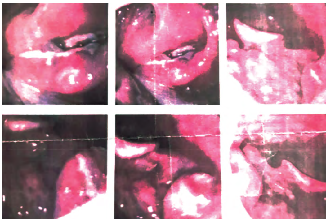
FIGURE 2. Ureteroscopic aspect of the mucosal ulcerative lesion

The patient's renal function deteriorated and it was accompanied by fever, leukocytosis and positive urine cultures that required prompt sanction of the stent. A following ureteroscopic investigation was conducted in another Urology Department where the stent was replaced but surprisingly noticing a ulcerative lesion on the right ureter (Figure 2). The team questioned if the ulcer was due to repeated ureteroscopic interventions that might have injured the mucosa on site or if it was a consequence of her yet uncontrolled vasculitis. Thus, a biopsy was made.